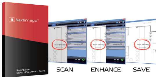
Optional Nextimage Scan+Archive More file formats and improved image controls.