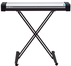
Optional Stand for easy moving and storing.